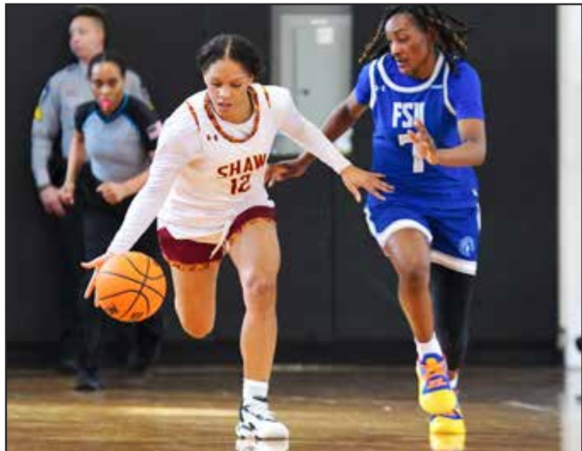
FSU WOMEN DOMINATE FINALE

As the Bison celebrate this historic sweep, one message rings clear: Howard is not just participating in the sport — it is helping shape its future and break barriers in the process.