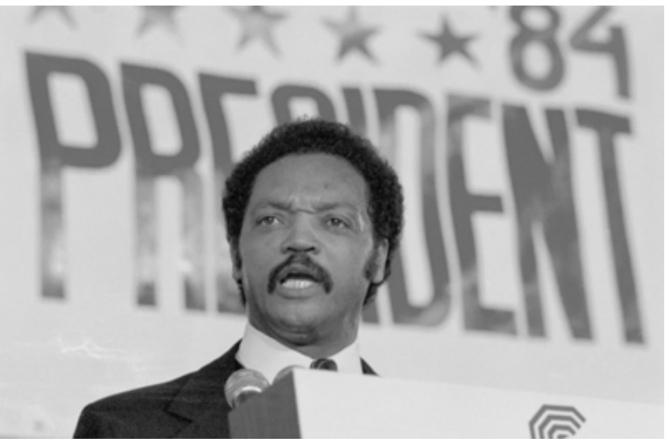
REV. JESSE JACKSON: OUR BALM IN GILEAD

Unsigned editorials in this space are the opinion of the newspaper. All other opinion pieces, including those from regular columnists, are the opinion of the writers themselves. The Carolinian strives to provide provocative commentary that is likely to spur thoughtful debate, regardless of whether we agree with it.