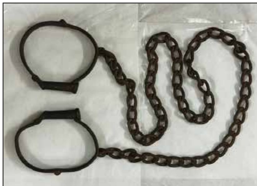
ANTIQUES AUCTION SELLING NECK SHACKLES ACCUSED OF 'PROFITING FROM SLAVERY'