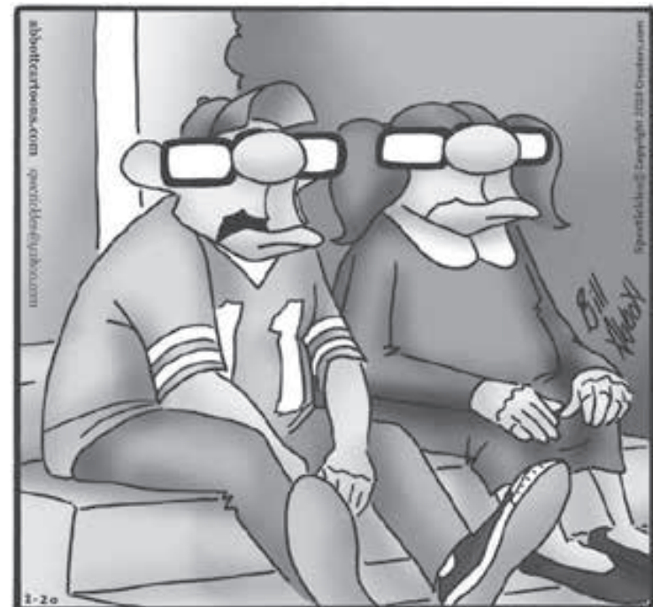
"My parents tried to home-school me and teach me all they know. Longest three minutes of my life."

That Jesse Jackson was able to live his life and die peacefully at age 84 is a beautiful thing. We're living in a confusing time right through here. There are so many things we take for granted now and it's easy to delude ourselves that the need for civil rights has passed. Although the nation is living under the weight of fear and intimidation pushing celebrations of cultural history and differences into dark spaces, don't get it twisted: there's still work to do. There's still much to overcome.