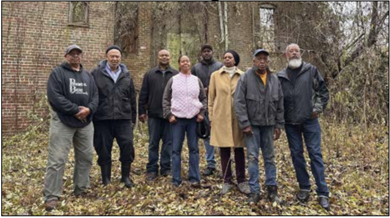
Descendants of Oak Hill sharecroppers stand outside the ruins of the property's once-grand plantation house near Danville, Va., Dec. 10, 2024.