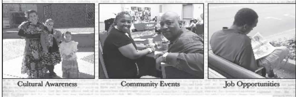
Cultural Awareness Community Events Job Opportunities