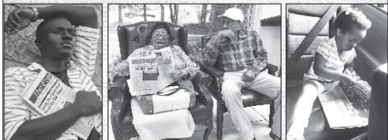
Inspirational Direction Generational Knowledge A Solid Foundation